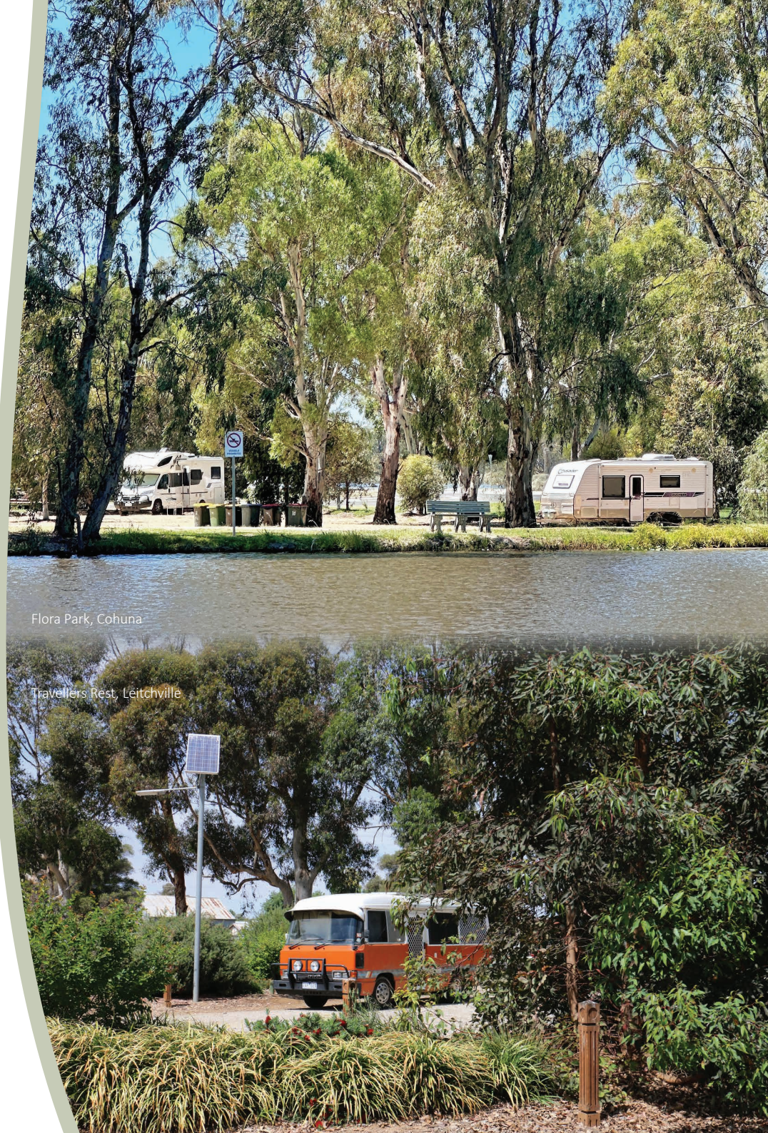
Flora Park, Cohuna

Secluded campsites can be found across the Gannawarra. Some popular locations include Gunbower Island, Guttrum and Benwell forests and the Koorangie (Avoca) Marshes. Contact the Gateway to Gannawarra Visitor Centre for more information on free camping areas.