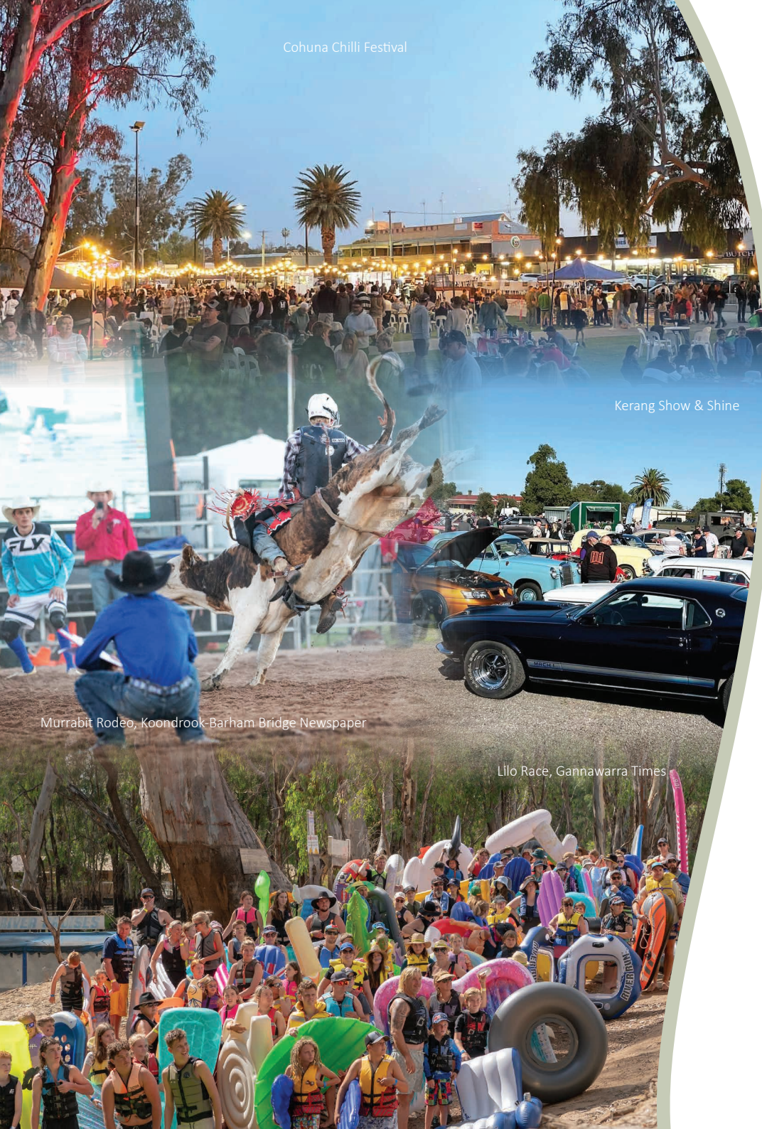
Kerang Show & Shine