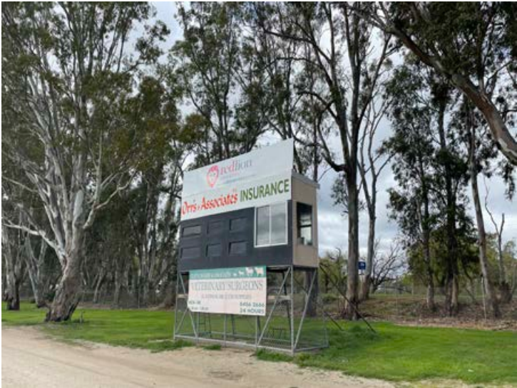
Old scoreboard for the main sports oval