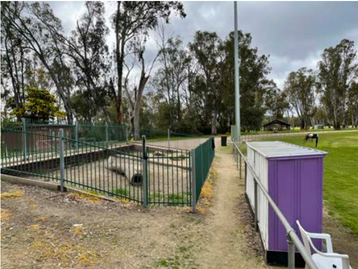
Existing play space and player boxes next to the main oval