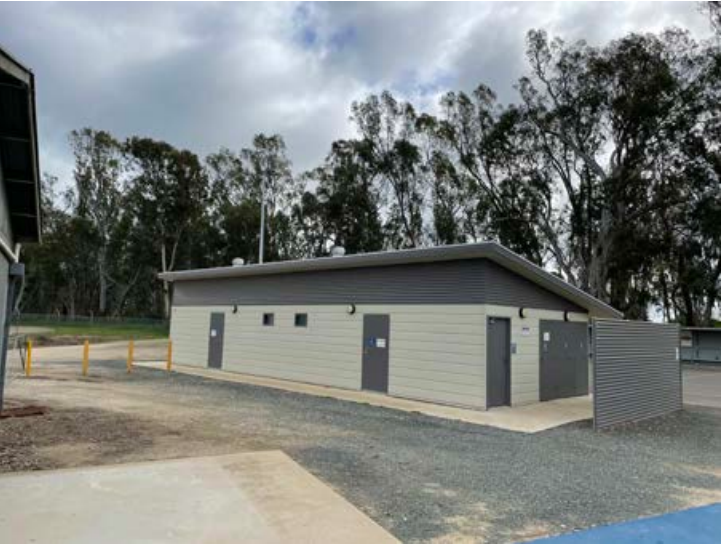
Recently constructed netball change and toilet facilities