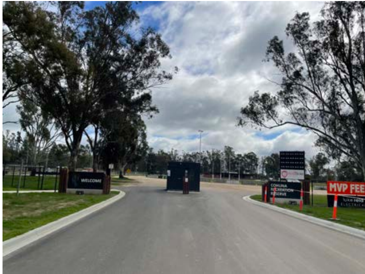
Recently completed upgrade to the reserve entrance