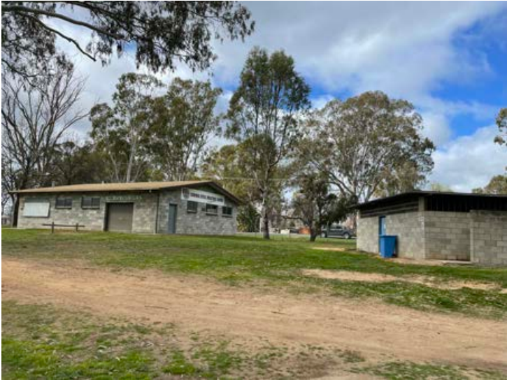
Athletics club building and toilets next to the northern oval