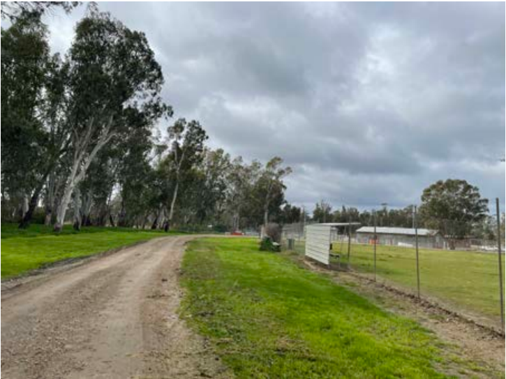
Interface between the tennis courts and the waterway