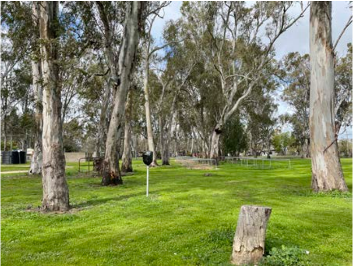
Agricultural show and camping infrastructure located between the ovals