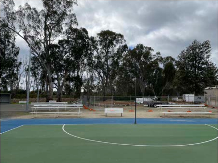
Recently resurfaced netball court and new agricultural society building under construction