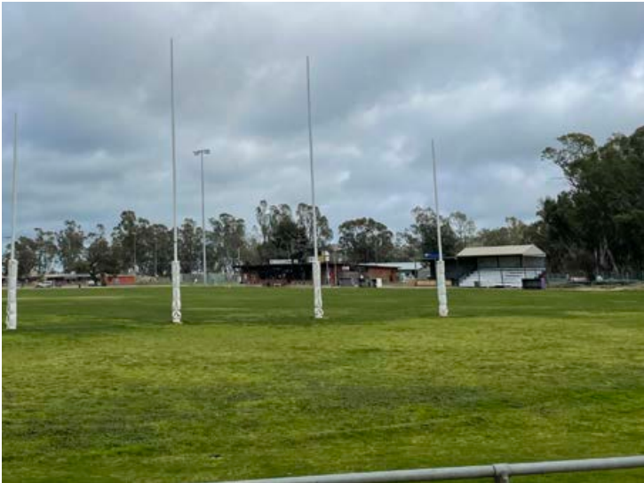
View across the main oval to pavilion and grandstand