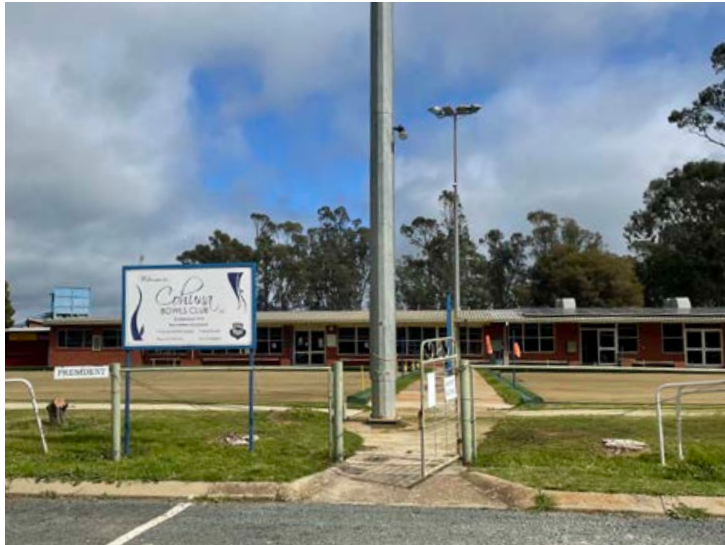
Entrance to the bowling club with the clubhouse in the background