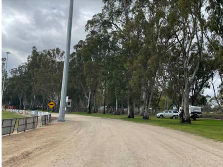
Free camping for visitors within the reserve