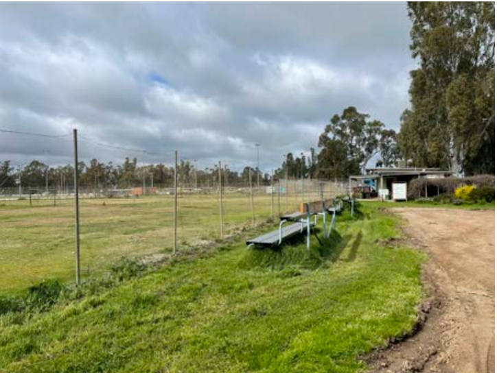
Entrance to the tennis courts and clubhouse