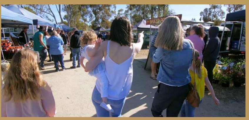
ABOVE: The Murrabit Country Market benefitted from support from the Gannawarra Community Resilience Grants program.

The grants will support community-led activities that align with the following priorities from the Gannawarra COVID-19 Community Relief and Recovery Plan.