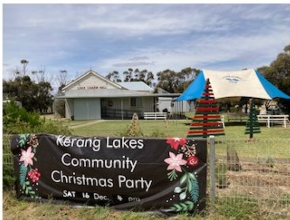
Kerang Lakes Community Christmas party at Lake Charm

There were many workshops and community events held across the Gannawarra leading up to Christmas and into the New Year, bringing residents together to connect. Events were held at Murrabit, the Kerang Lakes District, Cohuna, Kerang and Koondrook.