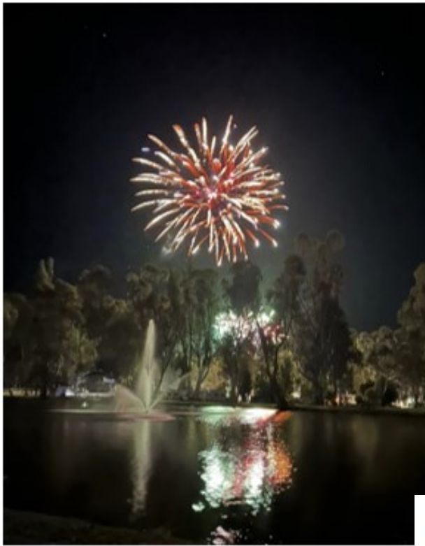
New Year's Eve celebrations in Cohuna