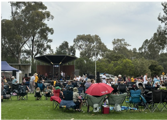
Kerang Community Christmas Carols