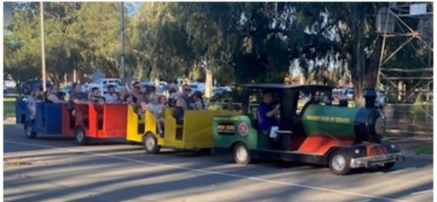
New Year's Eve celebrations in Kerang, above and below