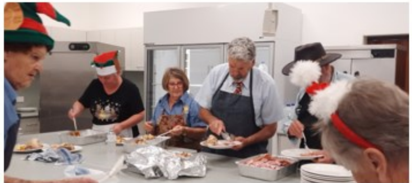
Cohuna Community Christmas Day lunch