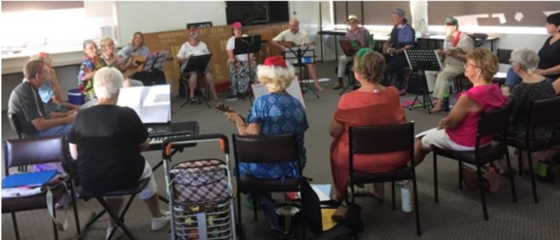
Come and Try Day on 13 December 2023 at Murrabit Hum N Strum

Events in Gannawarra Events are supported by funding from the Victorian and Commonwealth Governments under the Commonwealth-State Disaster Recovery Funding Arrangements (DRFA) as part of the Gannawarra Community Flood Recovery Program. For list of upcoming events, visit: www.gsc.vic.gov.au/events