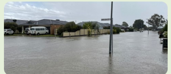
Photos: Flooding outside the Murrabit Hall (top), Kerang Swimming Pool (middle) and the intersection of Brolga and Marne streets, Kerang (bottom) following rain on Christmas Day 2023.

UPCOMING EVENTS - Council, Northern District Community Health and other agencies are partnering on three events in February. For further information and booking details see flyers on pages 2, 3 and 4 within this newsletter. To view Council's Events calendar and/or to add your event, please visit: www.gsc.vic.gov.au/events A reminder that submissions close on Sunday, 21 January for the One Year On Gannawarra Flood Reflections Exhibition. See page 5 for further details.