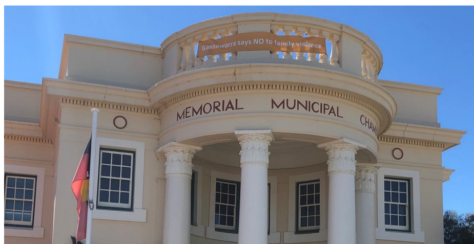
The Gannawarra Says No to Family Violence banner hangs proudly from the Kerang Council Chambers during this years campaign.

As part of this year's campaign, the Kerang Council Chambers was lit up with orange lighting during the 16 days, with a banner displayed from the historic building's balcony promoting the Gannawarra Says No to Family Violence message. Street banners were also on display along the Murray Valley Highway at Cohuna and Kerang.