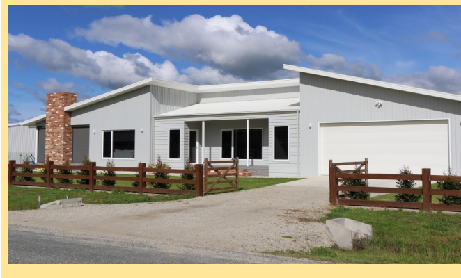
New residential home in Koondrook

With Melbourne experiencing difficulties, residential developers are now looking to regional Victoria where demand is strong.